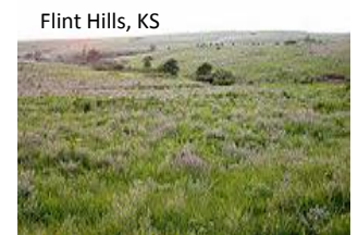
Flint Hills, KS

Deciduous Forest: These forest ecosystems make up the eastern half of North America and a large portion of Europe. This is the ecosystem in which Heritage Museums & Gardens is found. They typically have an average yearly temperature of 50° F and an average rainfall of 30-60 inches per year. These forests are inhabited by a variety of wildlife, including deer, bear, and foxes, as well as numerous species of trees, shrubs, and flowers. You will learn more about these varieties on your field trip.