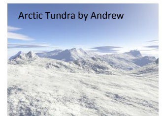
Arctic Tundra by Andrew

Tundra: The tundra ecosystems are found primarily north of the Arctic Circle and consist of short vegetation and essentially no trees. The soil is frozen and covered with permafrost for a large portion of the year. Some notable animals are caribou, polar bears, and musk ox; species with shaggy coats that have adapted to keep them warm year-round.