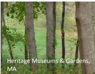
Heritage Museums & Gardens, MA

Deciduous Forest: These forest ecosystems make up the eastern half of North America and a large portion of Europe. This is the ecosystem in which Heritage Museums & Gardens is found. They typically have an average yearly temperature of 50° F and an average rainfall of 30-60 inches per year. These forests are inhabited by a variety of wildlife, including deer, bear, and foxes, as well as numerous species of trees, shrubs, and flowers. You will learn more about these varieties on your field trip.